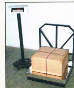
PLATFORM WITH SEPARATE STAND